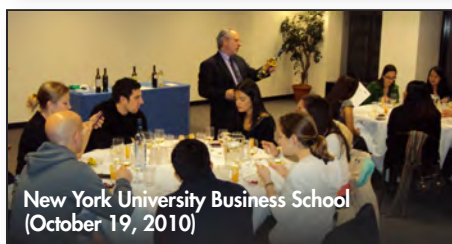
New York University Business School (October 19, 2010)