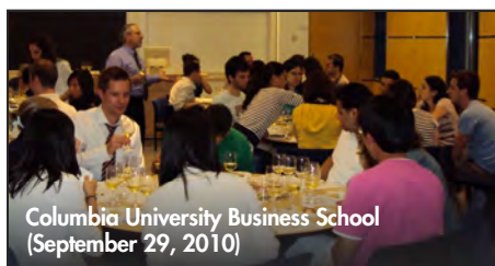
Columbia University Business School (September 29, 2010)

Guests at this year’s conference included Thomas Keller of the French Laundry, Iron Chef Morimoto, Ruth Reichl, former editor-in-chief of Gourmet , David Chang of Momofuku fame, and many of Japan’s two and three star chefs.