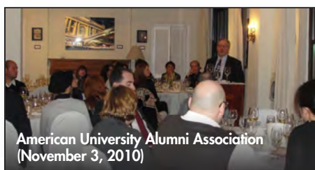
American University Alumni Association (November 3, 2010)